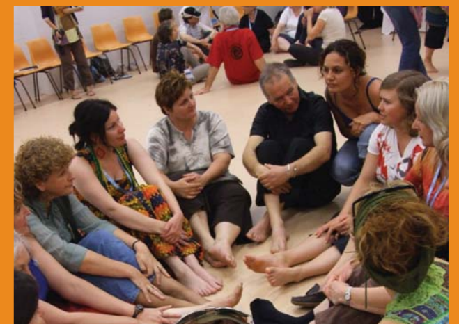
SOUND CIRCLES WORKSHOP, ARTS ACCESS THE PACIFIC EDGE

Regional Arts Australia produces a range of reports from time to time. Two publications currently available are: Heartwork: great arts stories from regional Australia (2004, co-published with the Australia Council with the support of the Australian Government through the Regional Arts Fund), which profiles exemplary regional arts projects; and National Directions: Regional Arts (2005) which outlines Regional Arts Australia's priorities and strategies for regional arts development. Contact your