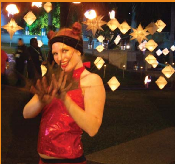
PHOENIX FIRE TRIBE, THE PACIFIC EDGE

2 McLaren Parade Port Adelaide SA 5015 P 08 8444 0424 F 08 8447 8496 E info@regionalarts.com.au www.regionalarts.com.au