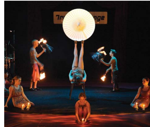
3wAyXchange MELBOURNE 2006

A sell-out at the 2006 Melbourne Commonwealth Games Cultural Festival were Brewarrina Youth Circus, Flying Fruit Fly Circus and South Africa's Zip Zap Circus, in a show called 3wAyXchange.