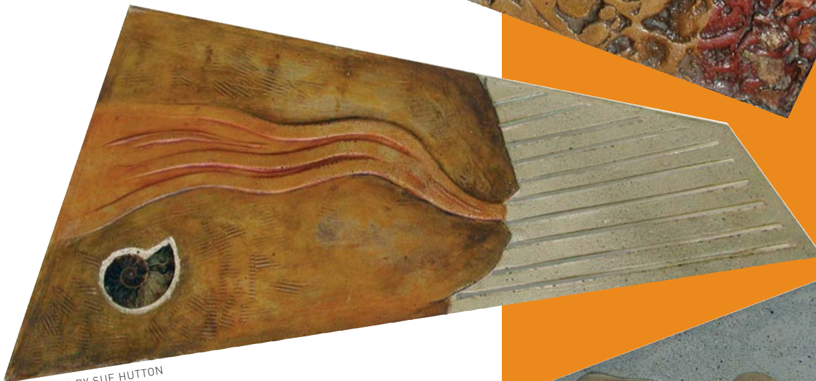
FIRST RAINS BY SUE HUTTON