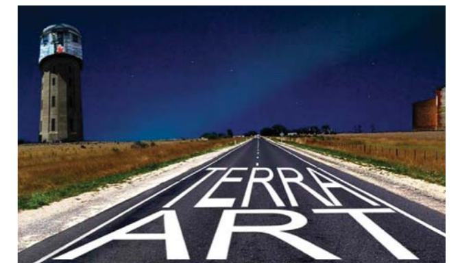
IMAGE FROM RED TAPE, TERRA-ART 2006

"In terms of saying what does this art project do for young people, sometimes it is just the fact that they are still alive. That's the indicator."