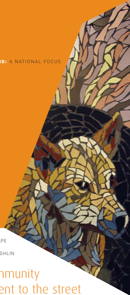
CHILDERS STREETSCAPE INSTALLATION ARTIST: ALICE MCLAUGHLIN