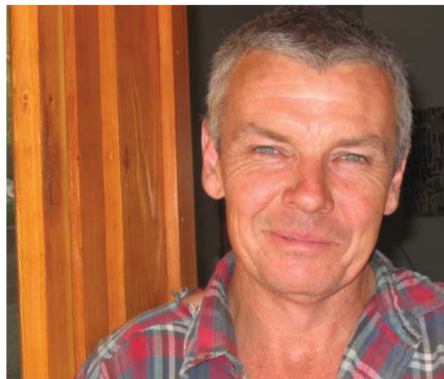
MICHAEL WATTS