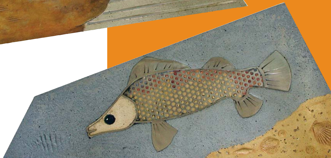
THE FISH BY SUE HUTTON