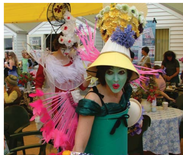
FIG TREE COMMUNITY HOUSE OPEN DAY, LORNE WEARABLE ART

The Regional Cultural Partnership Program has created five new Regional Arts Development Officer positions to focus on increasing access to arts and cultural infrastructure, developing networks and working with organisations to develop projects. The program has targeted the creation of partnerships within local government areas where there is little existing support for cultural development and where significant positive outcomes could be achieved for remote and Indigenous communities. In addition to Fund support, the program is supported by the Victorian State Government through Arts Victoria and the Community Support Fund and has secured matching financial contributions from 12 regionally based local government and cultural organisations.